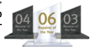
WINNER - REPAIRER OF THE YEAR

After an extended period of testing and customer satisfaction research, we are delighted to announce that Nationwide Autocentres have made PowerBoost available as part of their service facilities in selected Service Centres in the South of England. Increasingly motorists are demanding the de-coke as part of the maintenance of their cars as it gives noticeable improvements in performance and economy. Remember that the motorist needs to feel a real benefit from a service if customer loyalty and a sense of 'value added' is to be maintained! Nationwide have over 200 outlets and were voted the Autobody Repair Industry 'Repairer of the Year' last year.